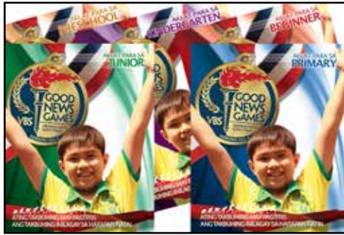
Covers for the Tagalog language VBS for 2017. ICP is preparing for 24,000 children in the Philippines.

Tagalog language visuals and teacher's manuals. The digital press in Texarkana is being used for this project. It will be the first time ICP/His Offspring Ministries will have produced the entire VBS curriculum in the Filipino national language. The pupil leaflets are being printed on the ICP press now in Hamburg, Arkansas.