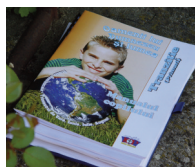
Romanian Sunday school book.

Since then the entire curriculum of Baptist Sunday school literature (about 50 books)