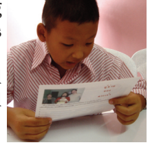
Thai boy reads Sunday School lesson to his class. Photo Oct. 2009

and animism, the people have difficulty understanding the Bible. ICP printed one thousand each of five books of Baptist doctrine in the Thai and Karen languages. Today, the ICP ministry has offices in Chiang Mai and Udon Thani, Thailand. ICP translators have translated several Sunday school books.