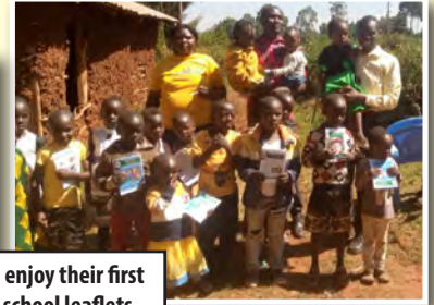
Children of Kenya enjoy their first ever CCfL Sunday school leaflets.