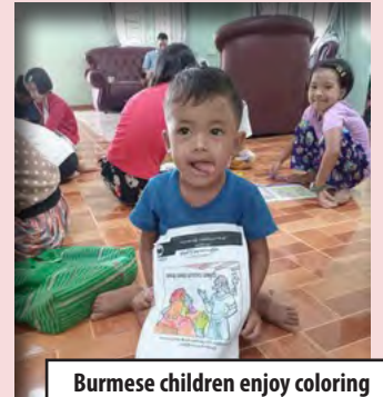
Burmese children enjoy coloring pictures in the CCfL lesson leaflets.